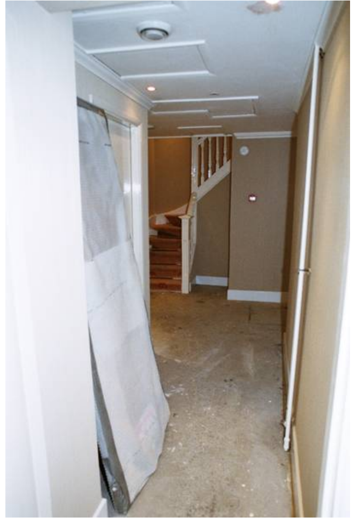
This is the corridor by my flat - at 9 October 2005