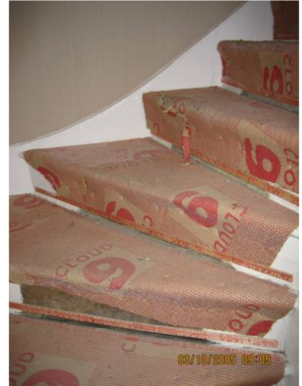
Stairs to / from my flat