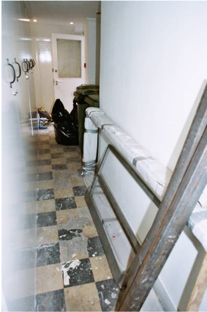
This is the access to the dustbins - at 9 October 2005