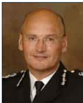
Sir Paul Stephenson Commissioner of Police of the Metropolis

A handwritten signature in black ink, appearing to read 'Boris Johnson'.