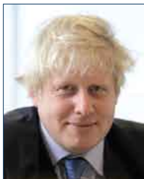
Boris Johnson Chair Metropolitan Police Authority

The MPA and MPS have made real strides in productivity and efficiency in recent years, realising savings of £139.6m from the 2009/10 budget while protecting, and enhancing, front line officer deployments. The Service recognises that there is more to be done and is determined to make the most efficient and effective use of the resources entrusted to us.